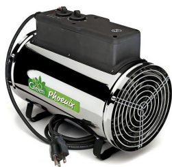
Bio Green Phoenix

Splash proof, 2,800W heating output. 270 CFM air circulation. Comes with built-in thermostat. Designed to be floor-standing or hanging. Fan setting perfect for increased circulation in summer months. Suitable for medium-sized greenhouses.