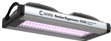
SolarSystem 550 . . . $650

The SolarSystem 550 LED grow light system offers programmable spectrum control over multiple wavelengths. It operates at a frequency of 50-60 Hz and draws a maximum current of 3.3A @ 120 V, 1.65 A @ 240 V. Power consumption ranges from 0-400 W. Covers bloom area of 4' x 4' and a vegetative coverage of 6' x 6'. Perfect as a single light or use several lights to cover a larger area underneath benches.