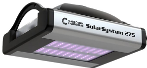
SolarSystem 275 . . . $390

Features CA Lightwork's exclusive Optigrow® light spectrum which offers the best results for all phases of growth in a single fixture. Optigrow® has been specially formulated and tested to give the best results in while offering full power for bloom and high yields. Consumes from 200 to 800 watts. Covers a 4 x 4 foot area.