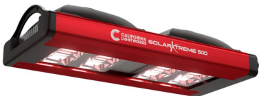
SolarXtreme 500 . . . $400

Features CA Lightwork's exclusive Optigrow® light spectrum which offers the best results for all phases of growth in a single fixture. Optigrow® has been specially formulated and tested to give the best results in while offering full power for bloom and high yields. Consumes from 200 to 800 watts. Covers a 4 x 4 foot area.