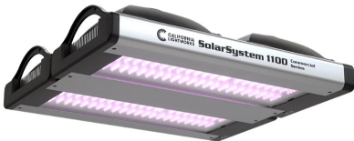
SolarSystem 1100 . . . $1,275

Lightweight and powerful, the SolarSystem 1100 is capable of replacing a 1000 watt HPS system. Can be used for veg or bloom. Fully programmable spectrum control. Covers a 5' x 5' bloom area or an 8' x 8' vegetative area.